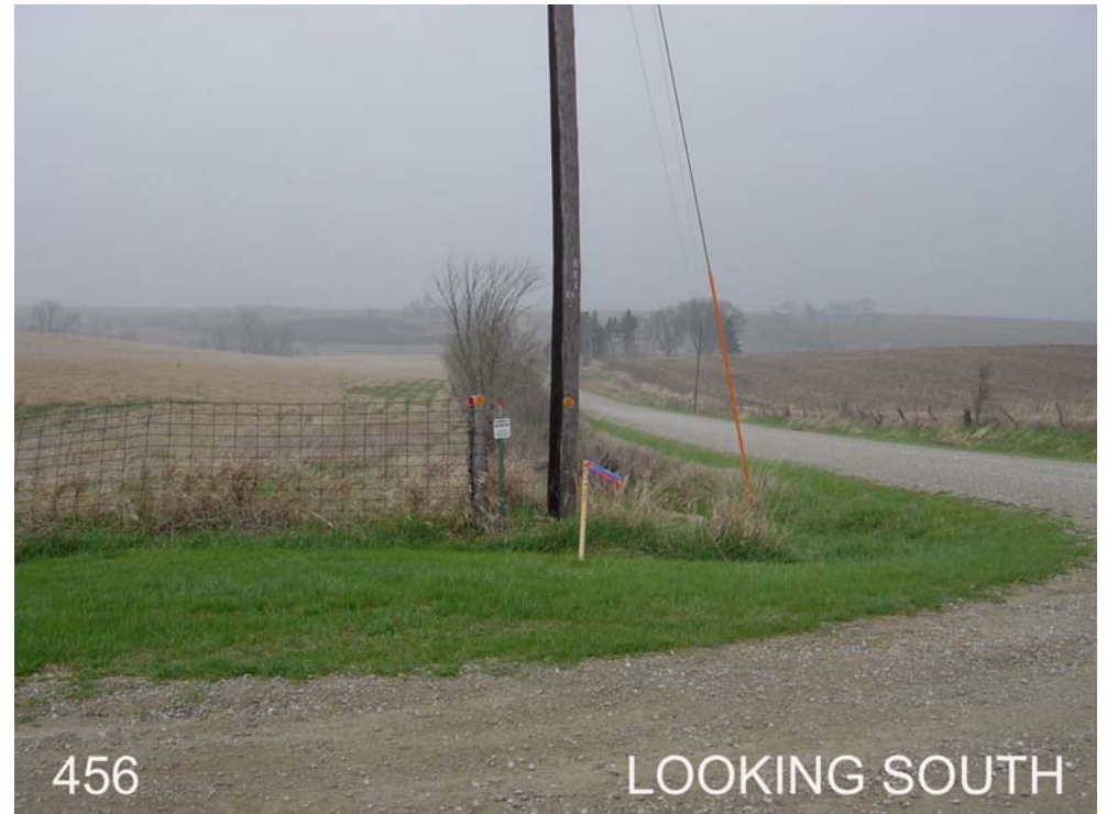
#456 is 5ft north of power pole, 30ft east of 305<sup>th</sup> Ave, 25ft south of Keokuk/Iowa Rd.