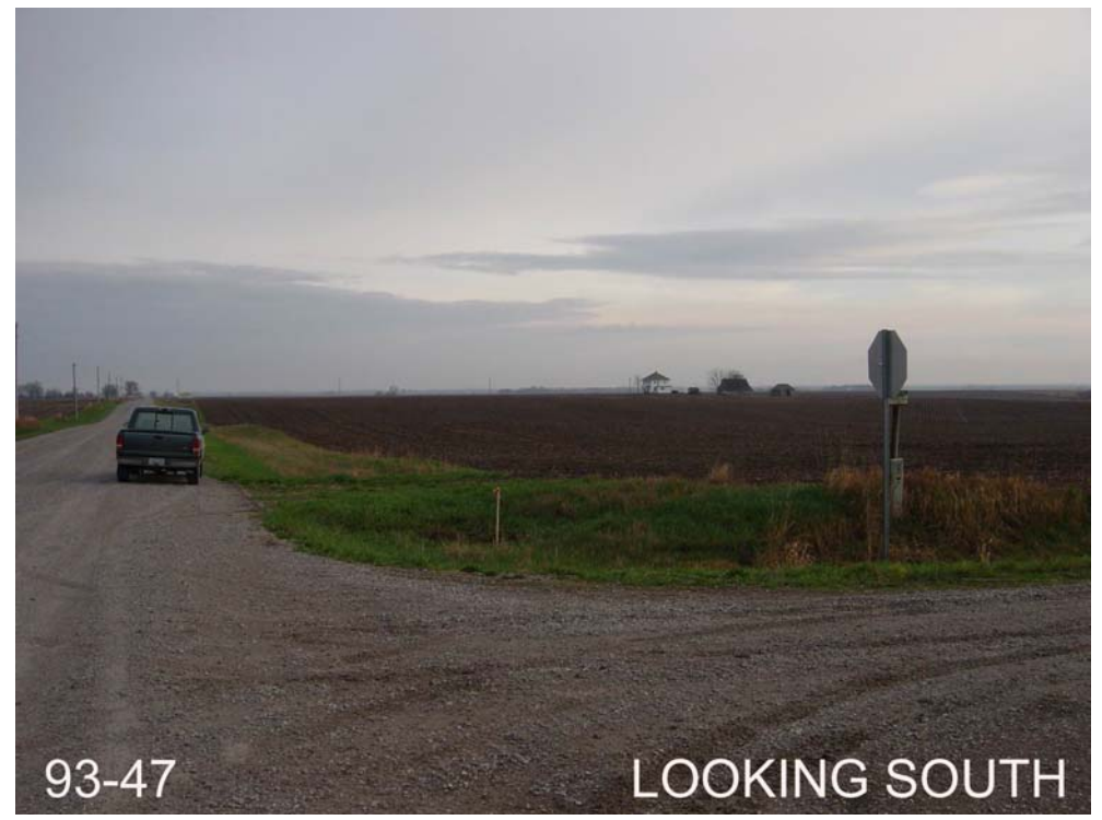
Found Wapello Co GPS point 93-47on 4-16-03