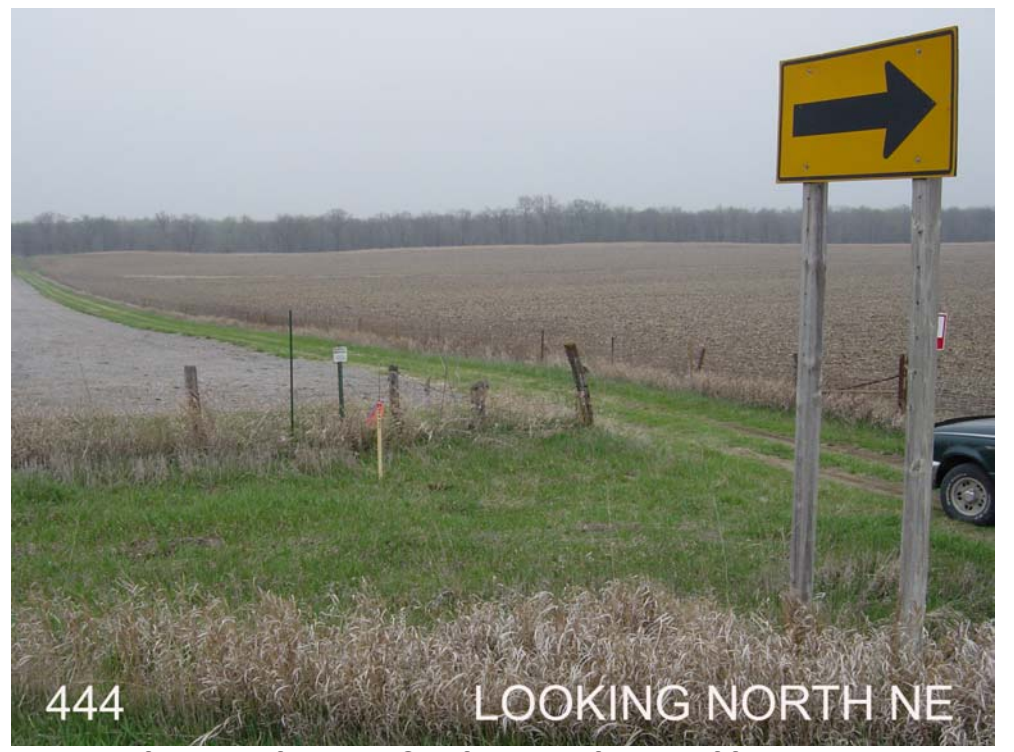
#444 is 5ft south of north ROW fence, 20ft west of field ent to the north, 45ft NE of curve( 255^{th} St to west, 240^{th} Ave to south). Near the E \frac{1}{4} corner of Sec 20, T75N, R11W.