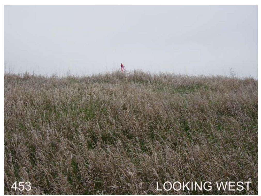
#453 is approx. 200ft west of V67 on top of high bank of back slope, 0.1mi north of 280<sup>th</sup> St.

Near the SE corner of Sec 13, T75N, R11W.