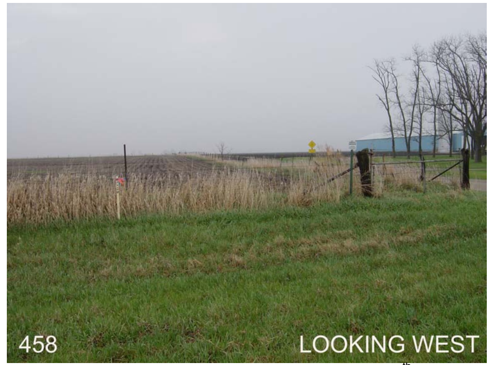
#458 is 4ft east of the west ROW fence, 50ft south of 160<sup>th</sup> St, 50ft west of 310<sup>th</sup> Ave.

Near the NE corner of Sec 4, T76N, R10W.