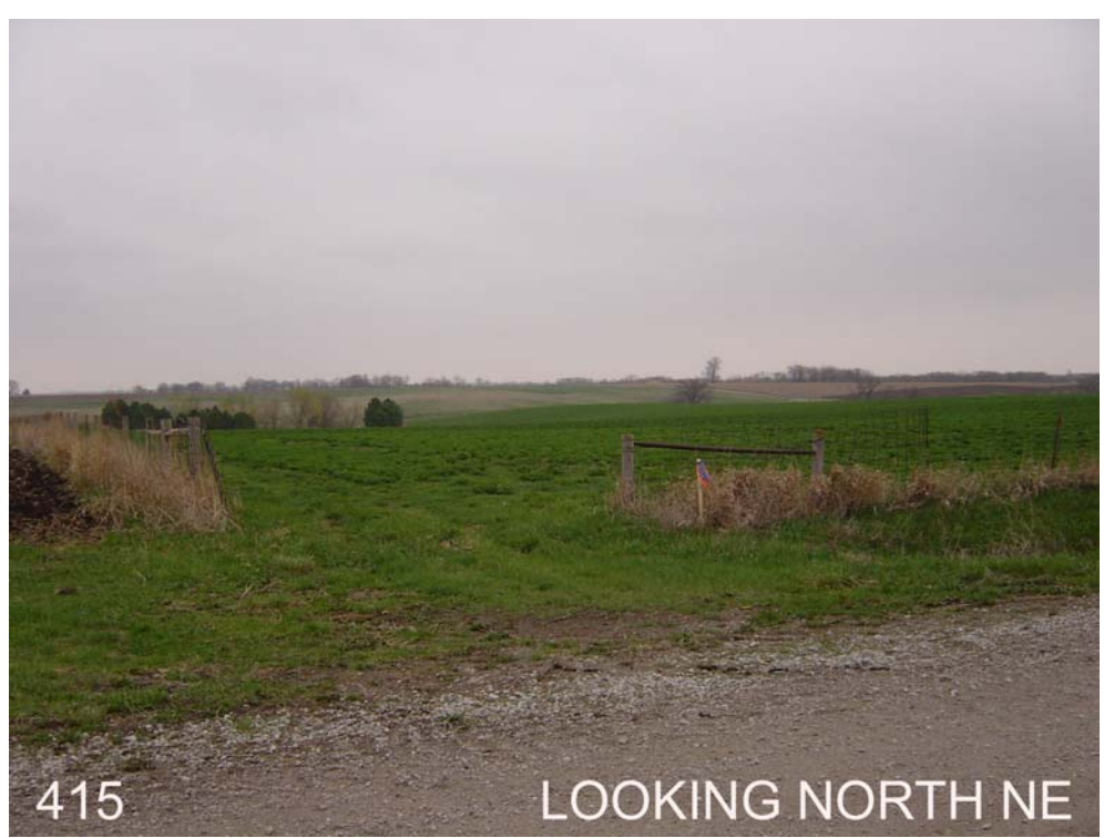
#415 is 3ft south of the north ROW fence, on east edge of field ent to the north, 30ft north of 310<sup>th</sup> St, ¼ mi west of 130<sup>th</sup> Ave. ¼ mile west of the SE corner of Sec 16, T77N, R13W.

1/4 mi north of the S 1/4 of Sec 33, T75N, R13W.