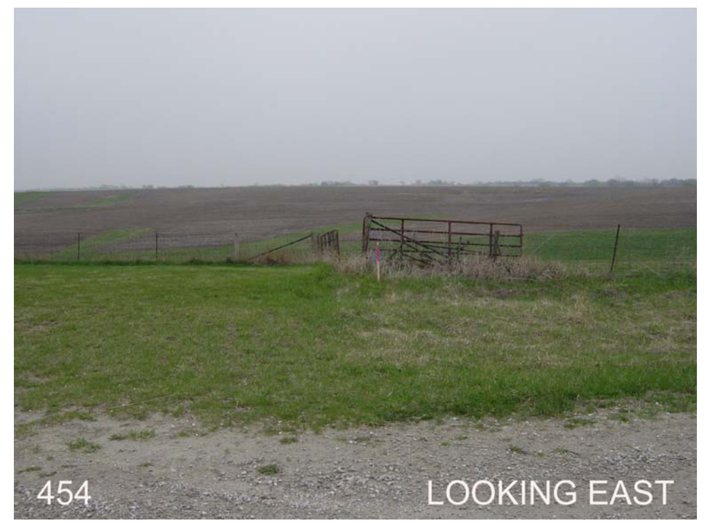
#454 is 4ft west of east ROW fence, 25ft south of entrance to "Church of the Brethern Cemetery", 50ft east of 280<sup>th</sup> Ave, approx. 500ft south of section line.