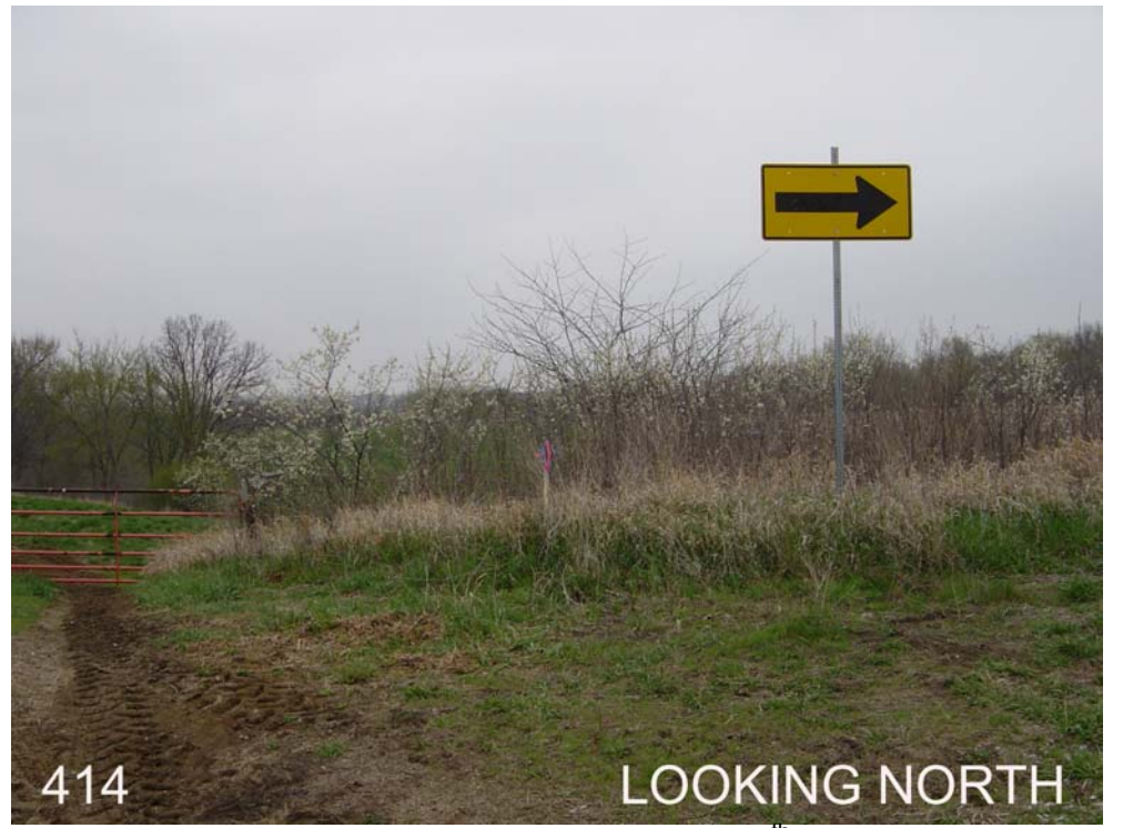
#414 is 45ft northwest of 90 degree curve in 270<sup>th</sup> St, 12ft east of field ent to the north.

1/4 mi north of the S 1/4 of Sec 33, T75N, R13W.