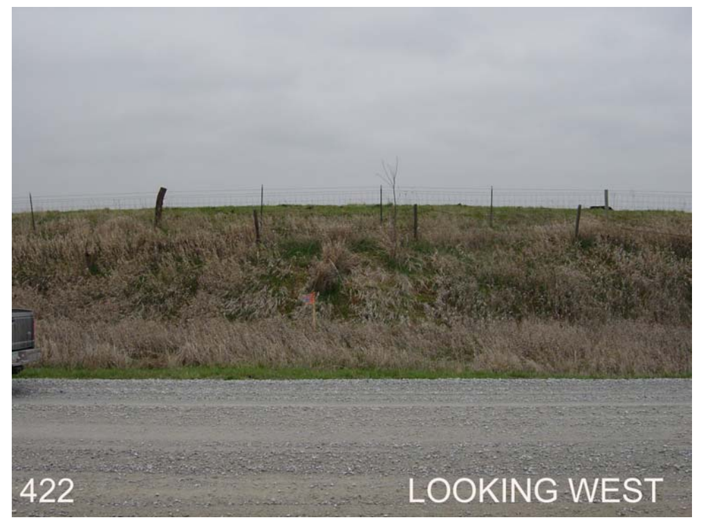
#422 is 25ft west of 160 Ave, 0.1mi south of the NE corner of Sec 24. 0.1mi south of the NE corner of Sec 24, T74N, R13W.