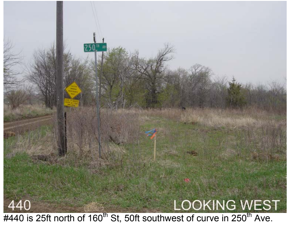
Near the SE corner of Sec 33, T77N, R11W.