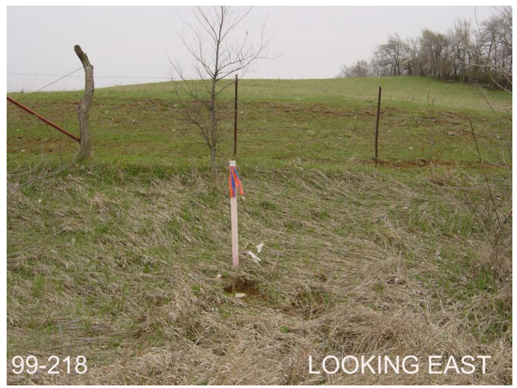
Found Iowa County GPS point 99-218 on 4-17-03