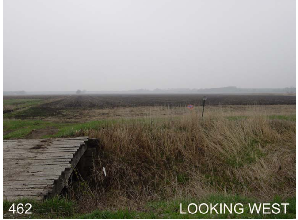
#462 is 20ft north of wood plank bridge over ditch, on an extension of 268<sup>th</sup> St to the west, 33ft west of 305<sup>th</sup> Ave. Near the S ½ corner of Sec 28, T75N, R10W.