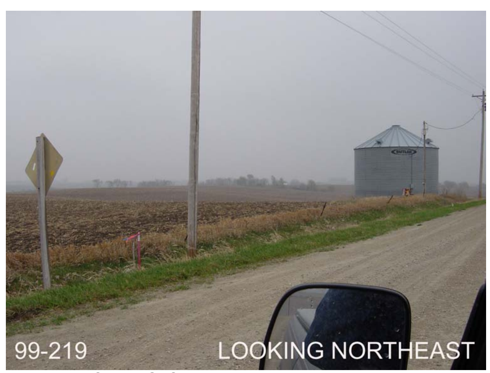
Found Iowa County GPS point 99-219 on 4-18-03