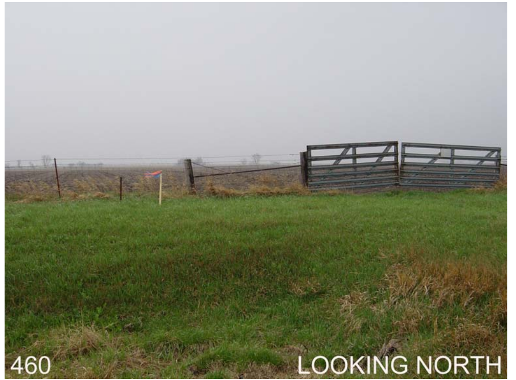
#460 is 5ft south of the north ROW fence, 25ft west of a field ent to the north, 60ft north of Hwy 92, 0.2mi east of 310^{th} Ave. In the SW \frac{1}{4} of Sec 34, T76N, R10W.