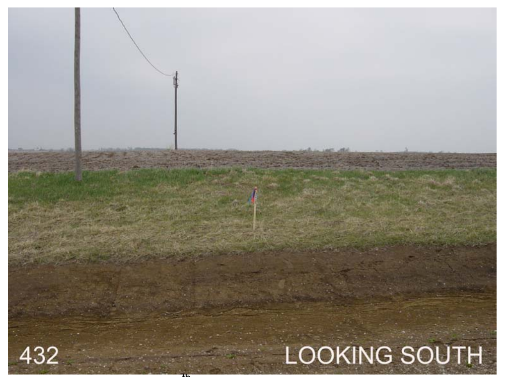
#432 is 35ft south of 160<sup>th</sup> St, 85ft east of drive to south, 0.1mi west of the section line.

0.1mi west of the NE corner of Sec 1, T76N, R12W.