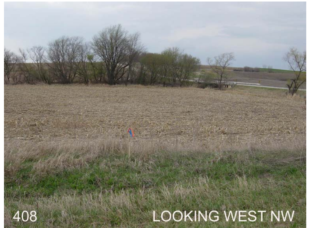
#408 is 30ft west of the west edge of Hwy 21, approx 200ft south of 540<sup>th</sup> Ave.(Poweshiek Co.) Near the NE corner of Sec. 4, T77N, R13W.