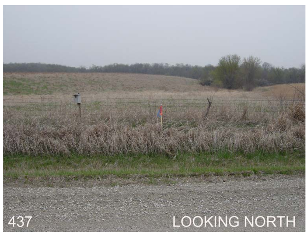
#437 is 3ft south of north ROW fence, 30ft north of 305<sup>th</sup> St, 0.1mi east of section corner.