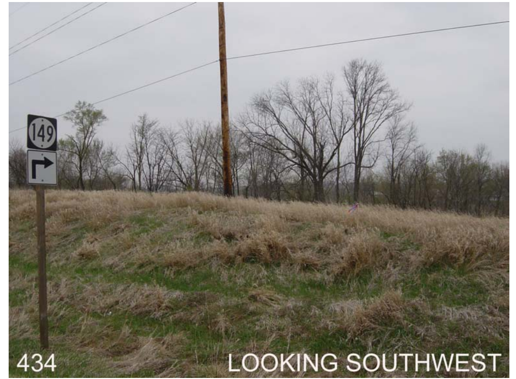
#434 is 55ft west of the west edge of Hwy 149, 55ft south of field ent to the west, approx. 600ft north of Hwy 92.

Approx. 600ft north of the SE corner of Sec 36, T76N, R12W.