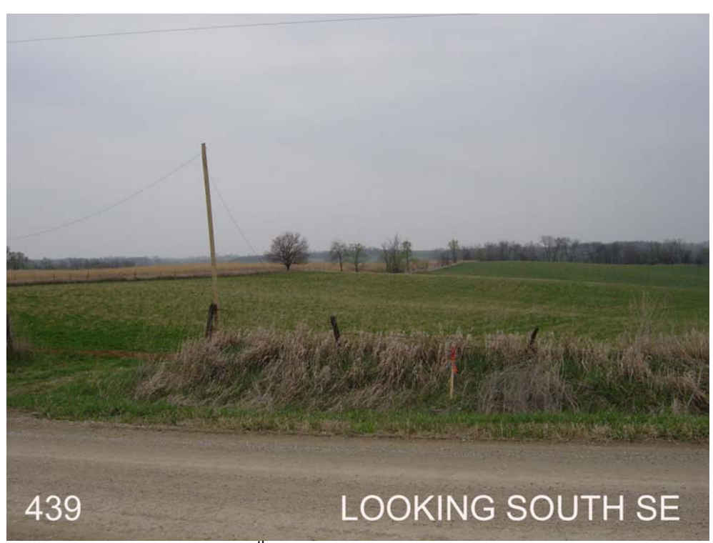
#439 is 25ft south of 120<sup>th</sup> St, 25ft west of field ent to south, approx. 200ft west of section line.

Near the NE corner of Sec 16, T77N, R11W.