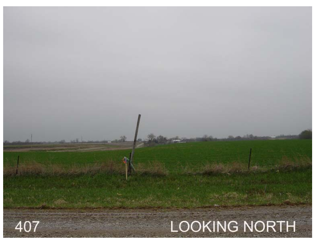
#407 is 3ft south of the north ROW fence, 30ft N of G65, approx. 200ft east of Yates Ave.

Near the W1/4 corner of Sec. 18, T74N, R13W.