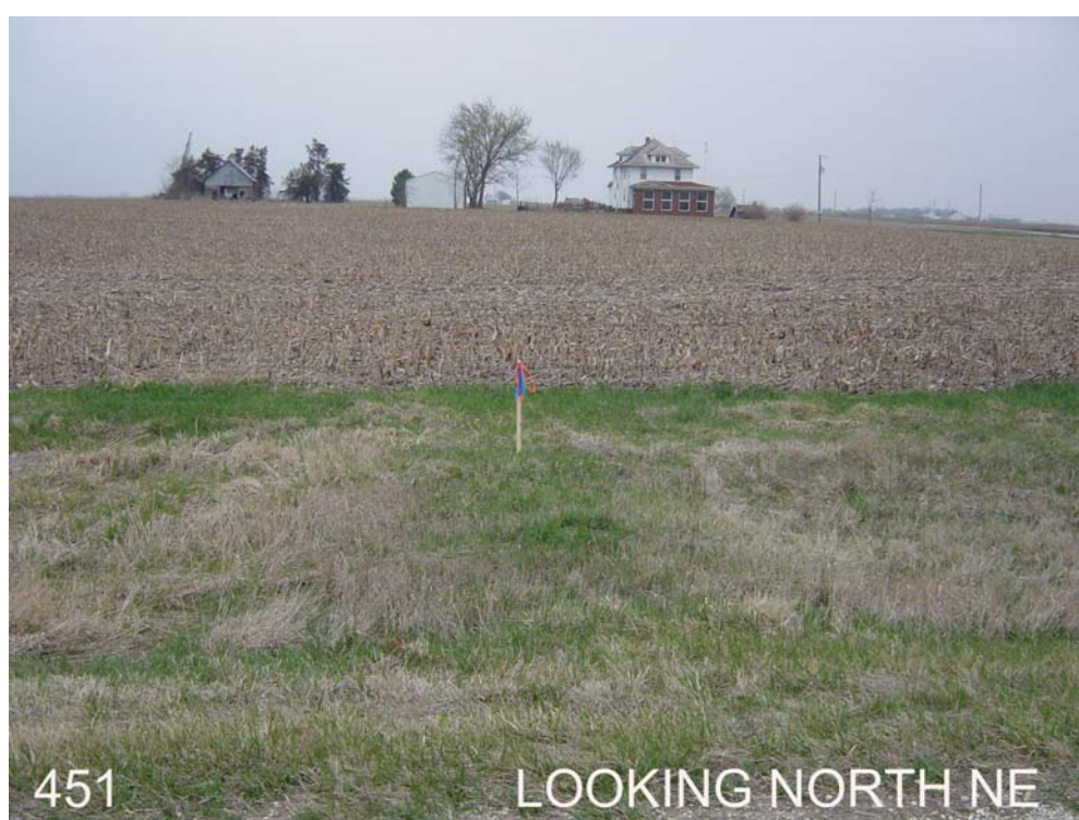
#451 is 35ft north of the north edge of Hwy 92, approx. 300ft west of V67(280<sup>th</sup> Ave.)

Near the SE corner of Sec 36, T76N, R11W.