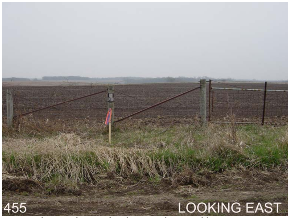
#455 is 4ft west of east ROW fence, 25ft north of field ent to the east, 20ft east of 280<sup>th</sup> Ave, 0.1mi south of 335<sup>th</sup> St. In the SW ¼ of Sec 31, T74N, R10W.