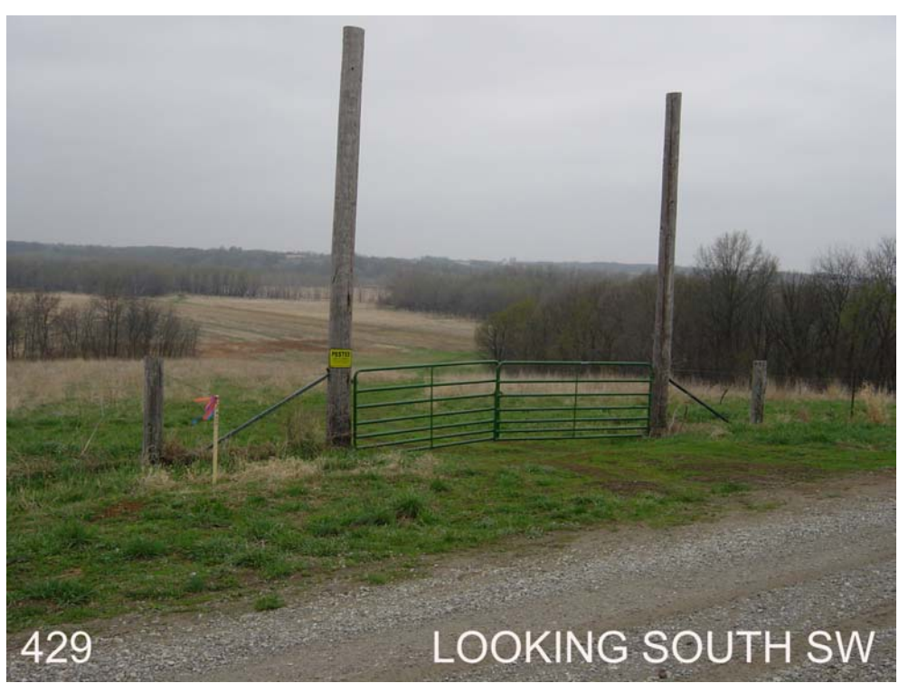
#429 is 6ft north of south ROW fence, 10ft east of field ent to south, 25ft south of 280<sup>th</sup> St, 0.1mi east of the NW corner of Sec 3. 0.1mi east of the NW corner of Sec 3, T74N, R12W.