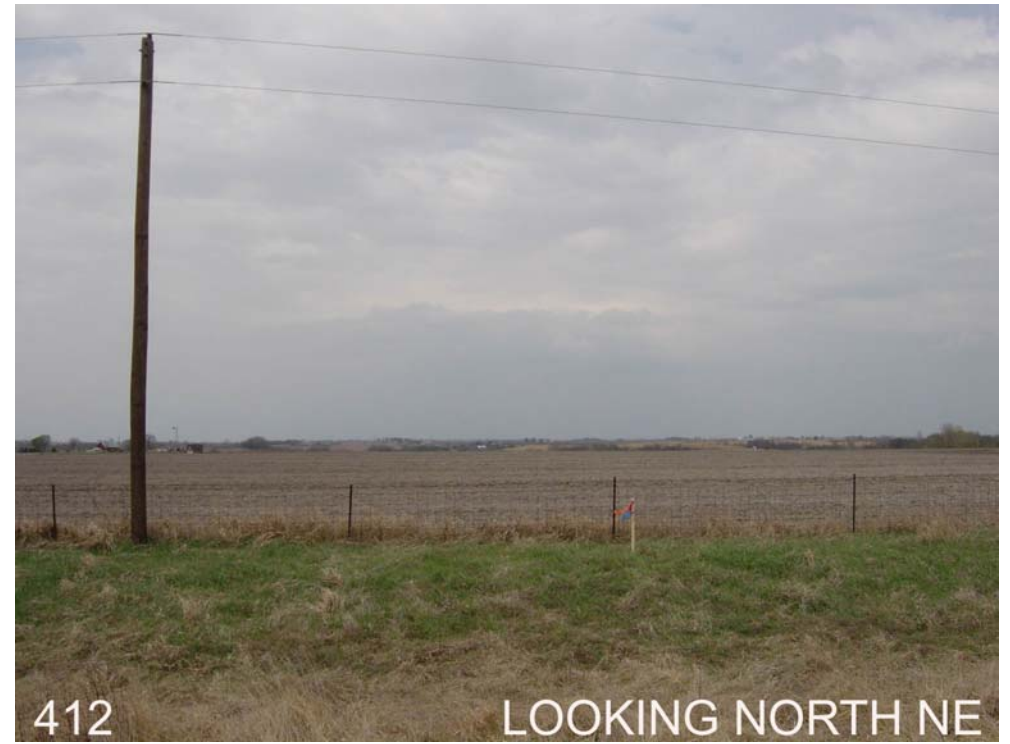
#412 is 5ft south of the north ROW fence, 60ft north of the north edge of Hwy 92, 0.1mi west of the Hwy 92 & Hwy21 intersection.