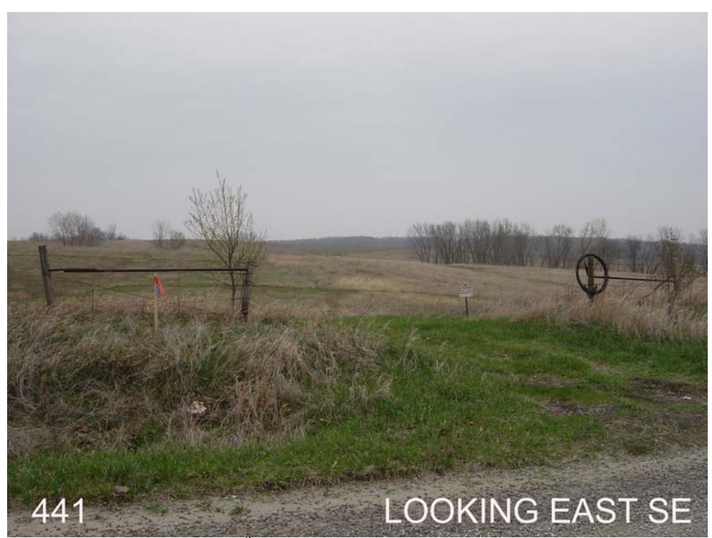
#441 is 30ft east of 250<sup>th</sup> Ave, 18ft north of cl of field ent to the east. Near the SW corner of Sec 15, T76N, R11W.