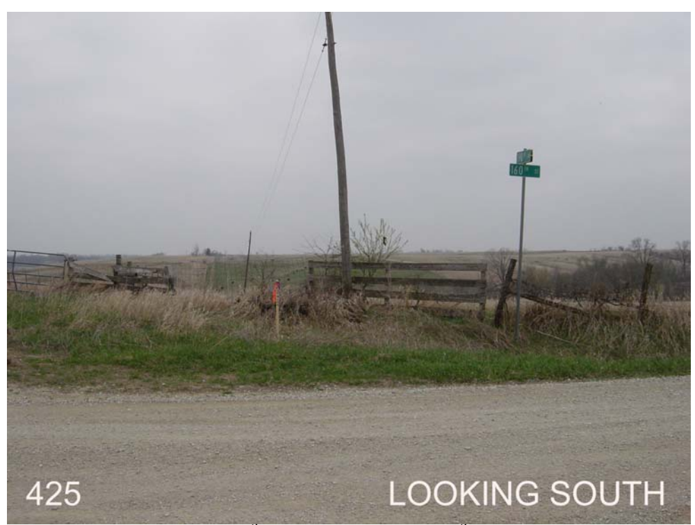
#425 is 25ft south of 160<sup>th</sup> St, 30ft west of 190<sup>th</sup> Ave, at tee intersection. Near the NE corner of Sec 4, T76N, R12W.