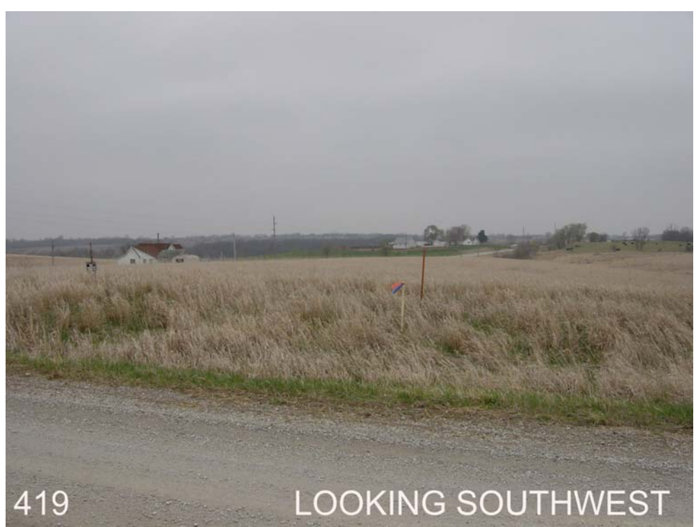
#419 is 5ft east of ROW marker,30ft west of 163<sup>rd</sup> Ave, 30ft north of field ent to the north, 0.1mi north of Hwy 92 In the SW ¼ of Sec 31, T76N, R12W.