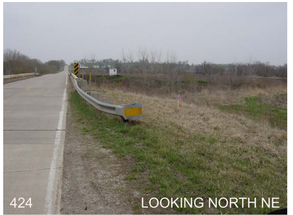
#424 is 15ft east of the east edge of V44, 45ft south of the south end of bridge deck (South Fork). Near the SW ¼ of Sec 15, T77N, R12W.