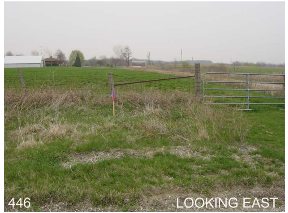
#446 is 3ft west of east ROW fence, 15ft north of field ent to the east, 30ft east of 248^{th} Ave, 60ft north of 305^{th} St In the NE \frac{1}{4} of Sec 16, T74N, R11W.