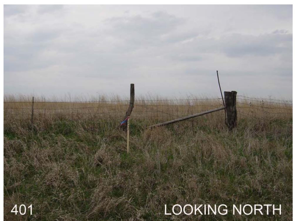
#401 is 5ft south of north row fence, 10ft west of offset in row fence, 30ft north of cl 130<sup>th</sup> St, Approx. 0.3mi east of the west line of Sec 18. In the SW ½ of Sec 18 T77N, R13W.