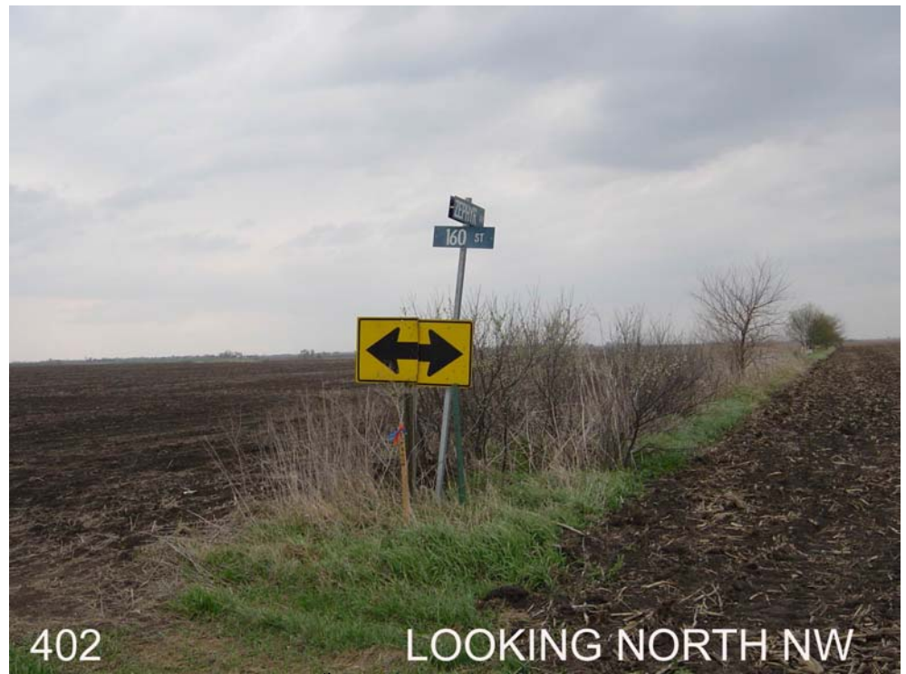
#402 is 30ft north of 160<sup>th</sup> St, on section line to north & on cl of Zephyr to the south.

Near the SW corner of Sec 31 T 77N, R13W.