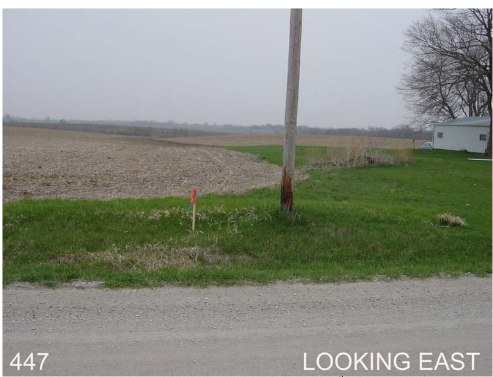
#447 is 6ft south of power pole, 30ft east of 250<sup>th</sup> Ave, 0.2mi north of county line.