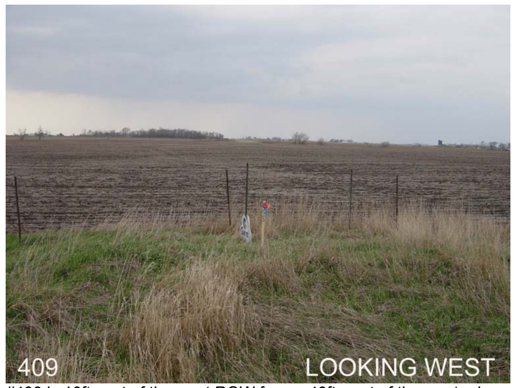
#409 is 10ft east of the west ROW fence, 40ft west of the west edge of Hwy 21, in a dead fill, approx 0.4mi north of 130<sup>th</sup> St. Near the E1/4 corner of Sec. 16 T77N, R13W.