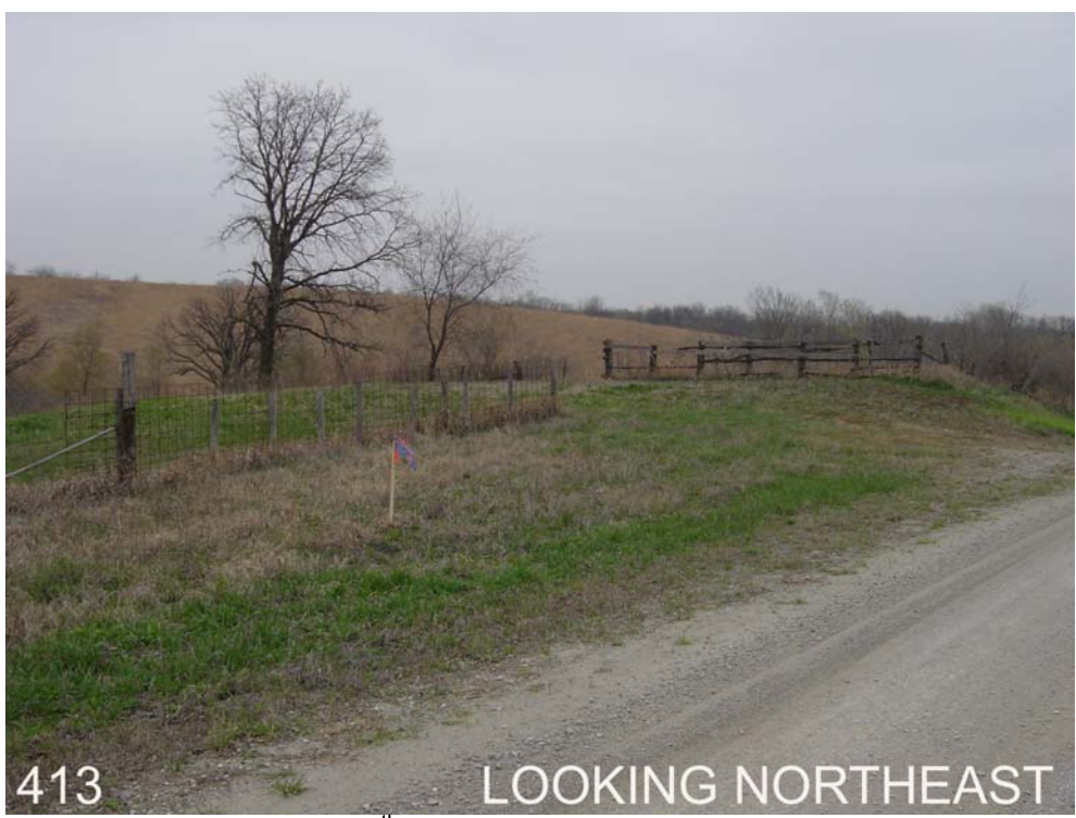
#413 is 25ft north of 250<sup>th</sup> St, 45ft west of a field ent to the north. Near the S1/4 of Sec 16, T75N, R13W.