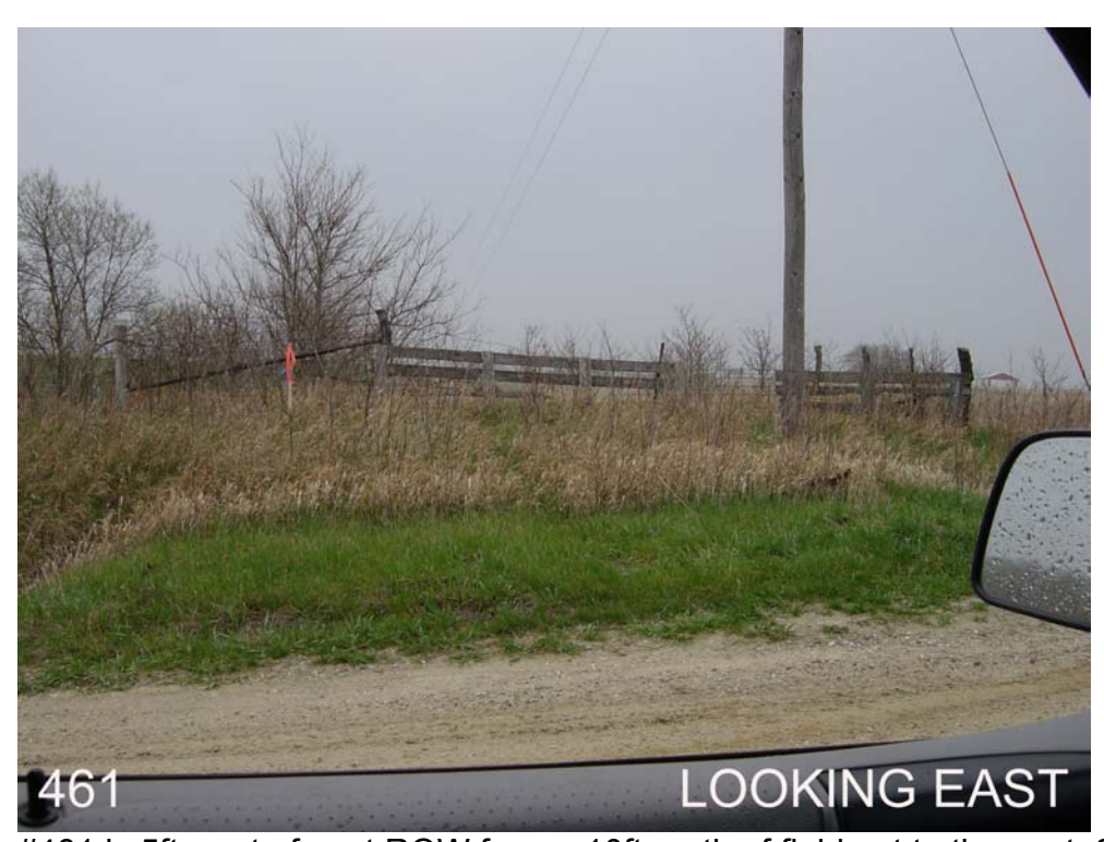
#461 is 5ft west of east ROW fence, 10ft north of field ent to the east, 30ft east of 310^{th} Ave, 55ft north of 253^{rd} St to the east. In the NW ½ of Sec 22, T75N, R10W.