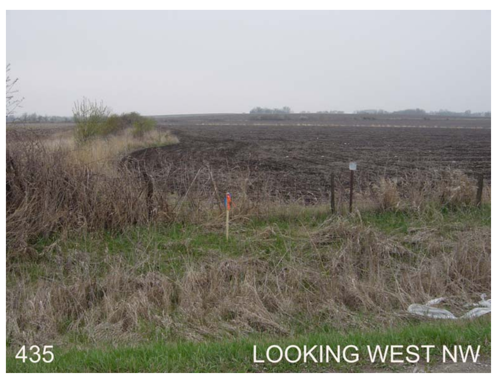
#435 is 3ft east of west ROW fence, 15ft north of the section line, 30ft west of 220<sup>th</sup> Ave.

Approx. 600ft north of the SE corner of Sec 36, T76N, R12W.