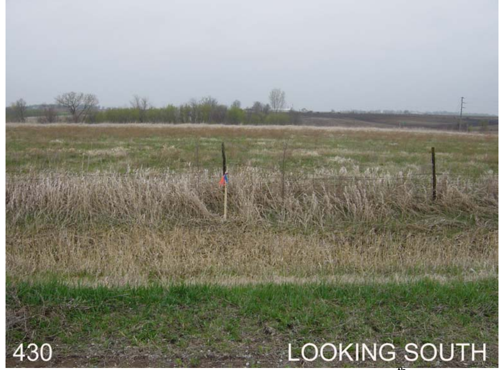
#430 is 3ft north of south ROW fence, 30ft south of 310<sup>th</sup> St, 25ft west of power pole, 200ft east of 190<sup>th</sup> Ave. Near the NW corner of Sec 22 T74N, R12W.