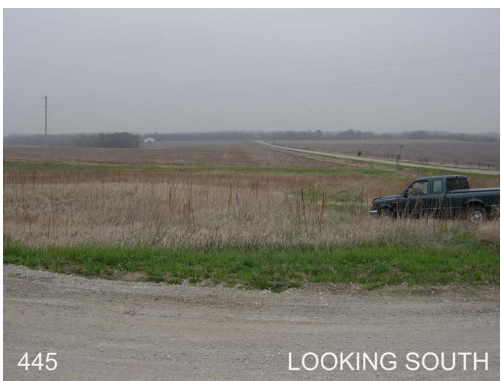
#445 is 45ft southwest of curve in V5G, 50ft south of 253<sup>rd</sup> Ave. In the NW ¼ of Sec 3, T74N, R11W