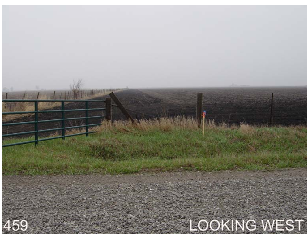
#459 is 3ft east of the west ROW fence, 25ft north of a field ent to the west, 30ft west of 310<sup>th</sup> Ave, ¼ mi north of 190<sup>th</sup> St. In the SE ¼ of Sec 16, T76N, R10W.

Near the NE corner of Sec 4, T76N, R10W.