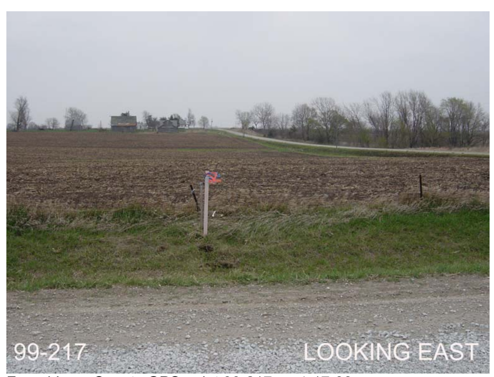
Found Iowa County GPS point 99-217 on 4-17-03