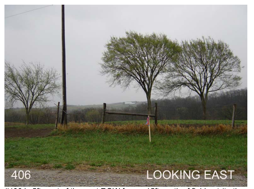
#406 is 5ft west of the east ROW fence, 15ft south of field ent.(to the east), 25ft east of Yates Ave, 0.1 mile south of 280<sup>th</sup> St. In the NW ¼ of Sec 6, T74N, R13W.