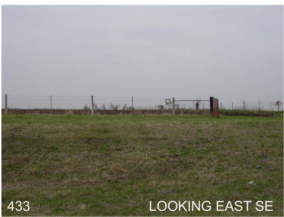
#433 is 5ft west of the east ROW fence, 45ft north of the cl of field ent to the east, 75ft east of the east edge of Hwy 149. Near the SW corner of Sec 18, T76N, R11W.

0.1mi west of the NE corner of Sec 1, T76N, R12W.