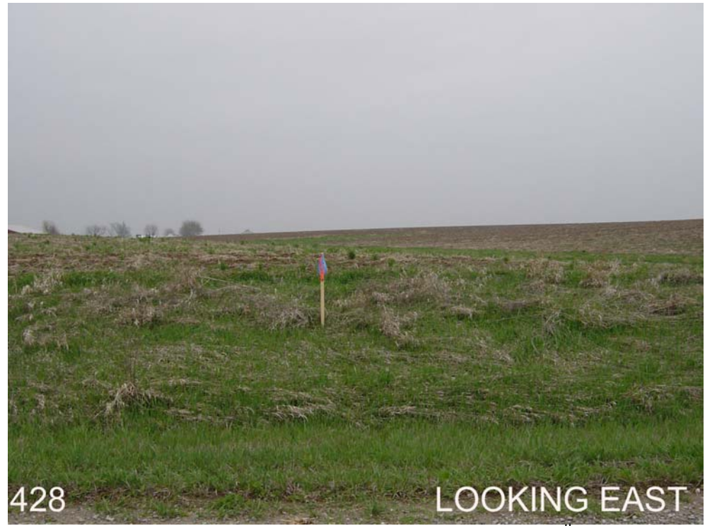
#428 is 25ft east of 190 Ave, approx. 300ft south of 255^{th} St(to the east) In NW \frac{1}{4} of Sec 22, T75N, R12W.