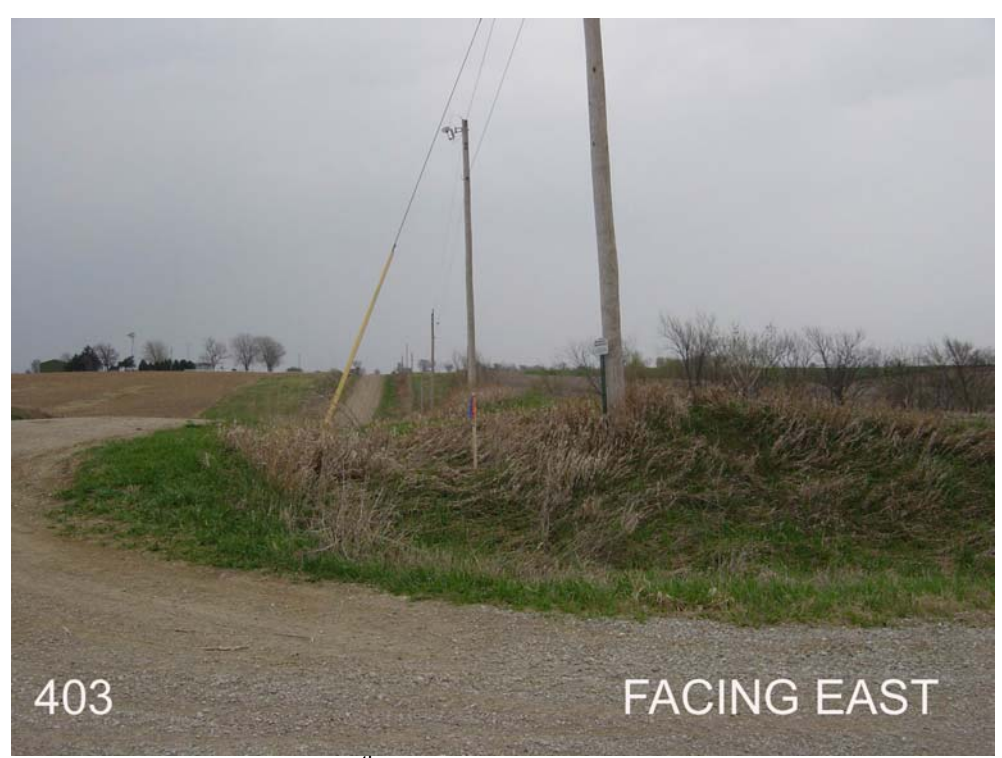
#403 is 30ft south of 190<sup>th</sup> St, 30ft east of Zephyr Ave. Near the NW corner of Sec 19 T76N, R13W.

Near the SW corner of Sec 31 T 77N, R13W.