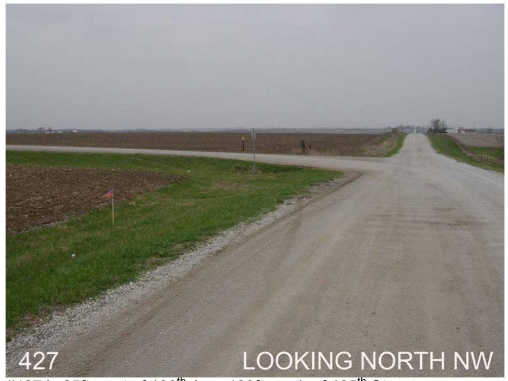
#427 is 25ft west of 190<sup>th</sup> Ave, 100ft south of 185<sup>th</sup> St. In the SE 1/4 of Sec 33, T76N, R12W.