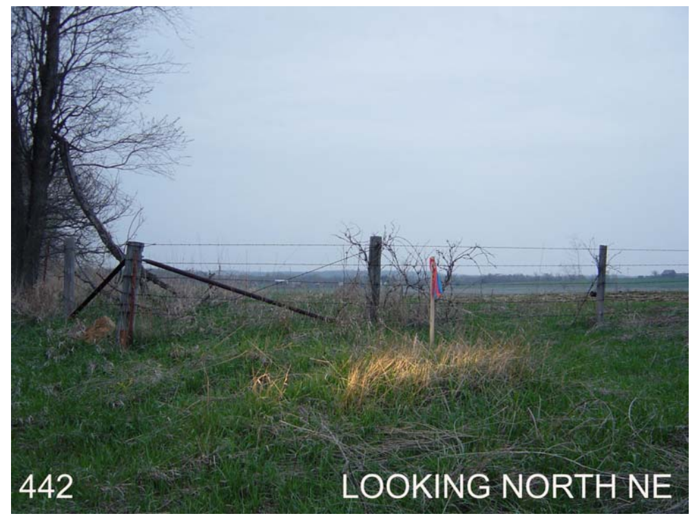
#442 is 5ft south of north ROW fence, on high bank of back slope, 1/4mi east of section line.