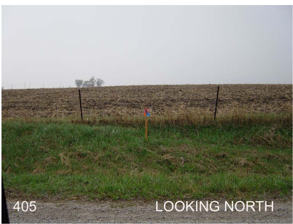
#405 is 4ft south of the north ROW fence, 30ft north of 250<sup>th</sup> St, 0.1mi east of Zephyr Ave.

0.1mi east of the SW cor of Sec 18, T75N, R13W.