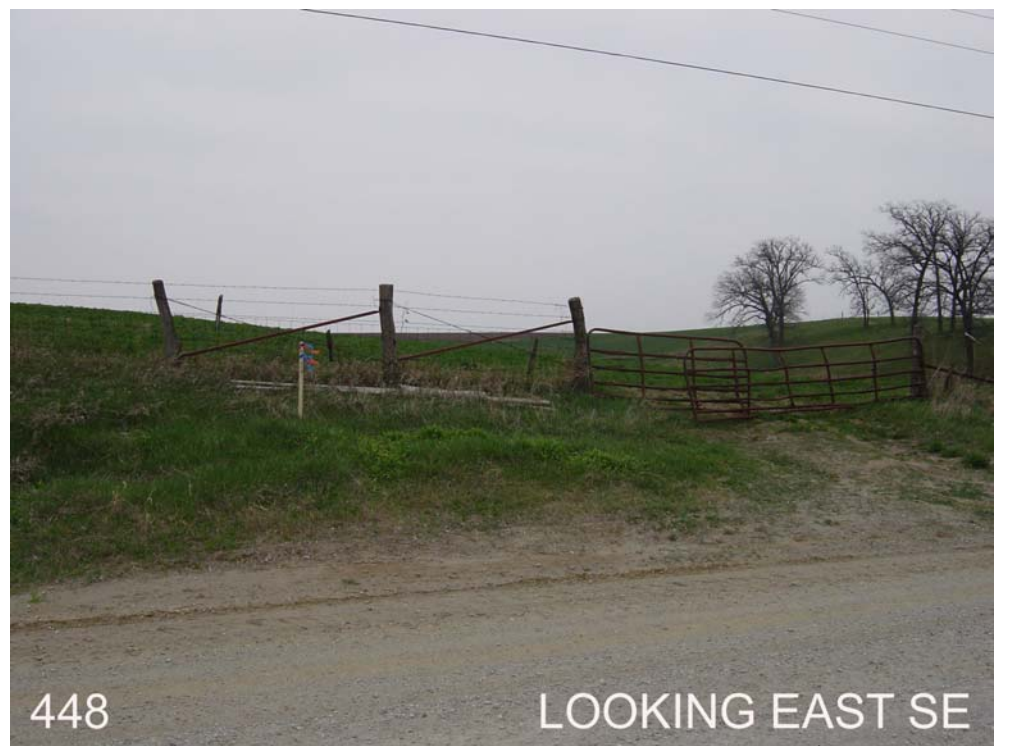
#448 is 25ft north of field ent to the east, 25ft east of 280<sup>th</sup> Ave, approx 150ft south of section line.

Near the NW corner of Sec19, T77N, R10W.