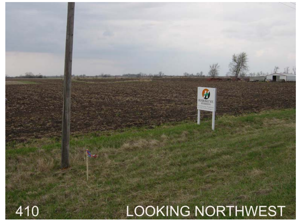
#410 is 5ft east of a power pole, 35ft west of the west edge of Hwy 21, approx. 300ft north of 160<sup>th</sup> St. Near the SE corner of Sec 33, T77N, R13W.