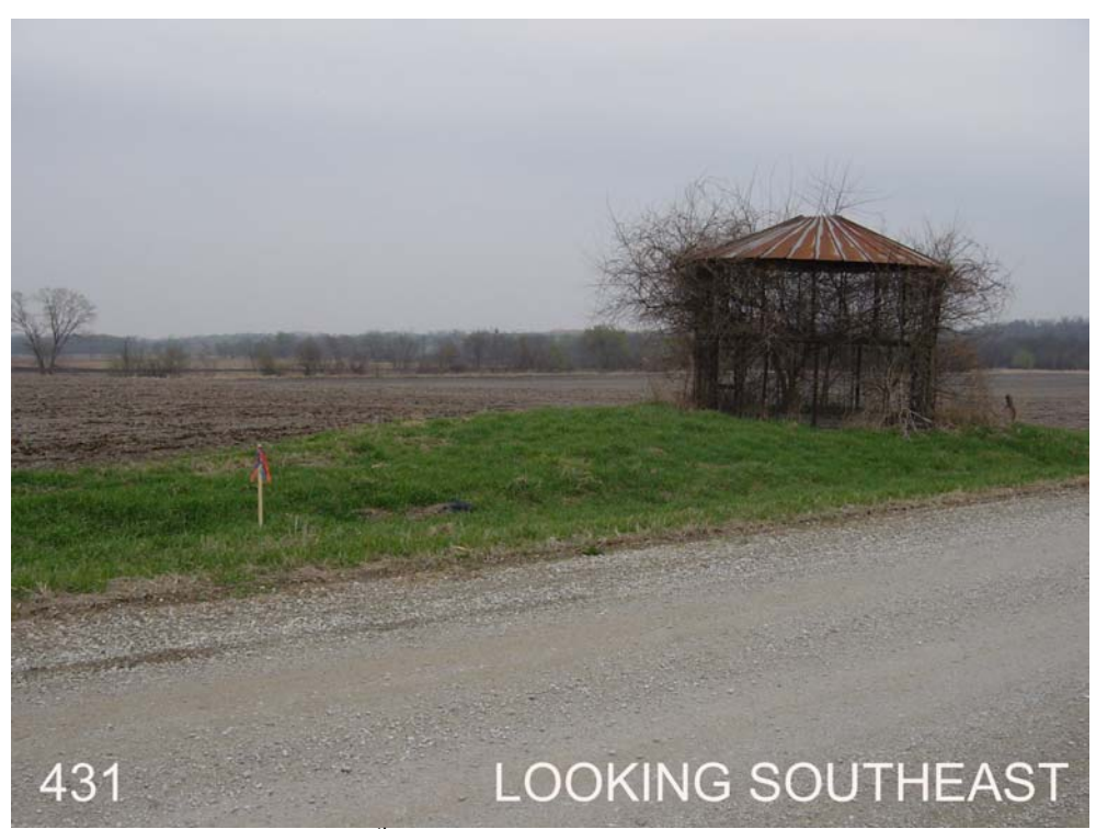
#431 is 25ft east of 225<sup>th</sup> St, 70ft north of section line. In the SW ¼ of Sec 18, T77N, R11W.