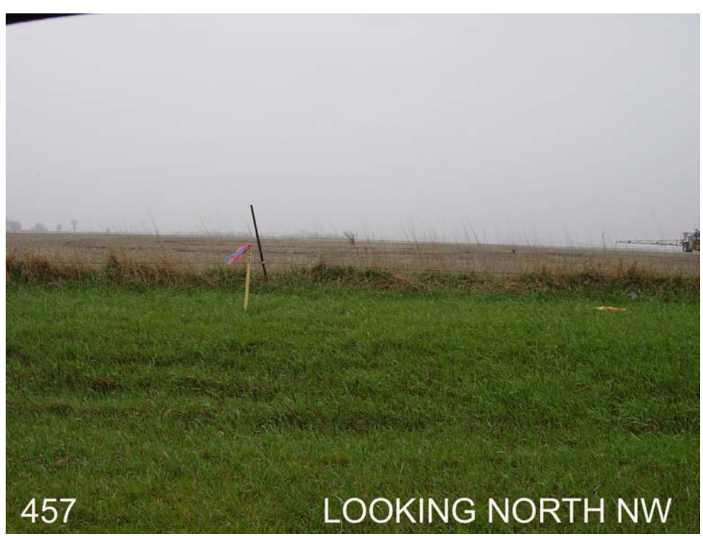
#457 is 5ft south of north ROW fence, 40ft north of north edge of Hwy 22, approx. 300ft west of 312^{th} Ave. In the SW \frac{1}{4} of Sec 22, T77N, R10W.