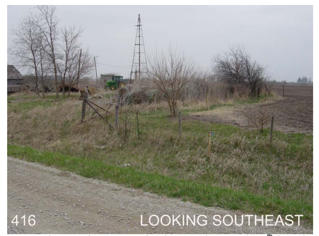
#416 is 4ft north of the south ROW fence, 30ft south of 130<sup>th</sup> St, 25ft west of vacated farmstead, ¼ mile west of 160<sup>th</sup> Ave. ¼ mile west of the NE corner of Sec 24, T77N, R13W.