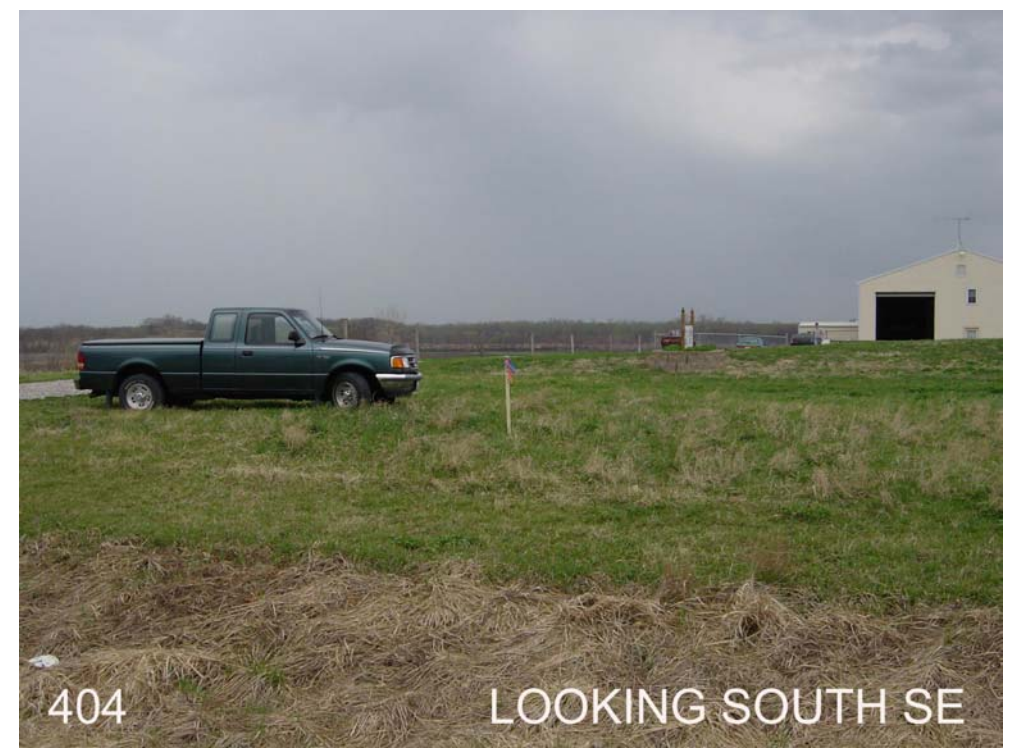
#404 is 30ft west of ent to "Collision Repair Center", 50ft south of Hwy. 92, approx. 200ft east of Zephyr Ave to north. Near the NW corner of Sec. 6, T75N, R13W.