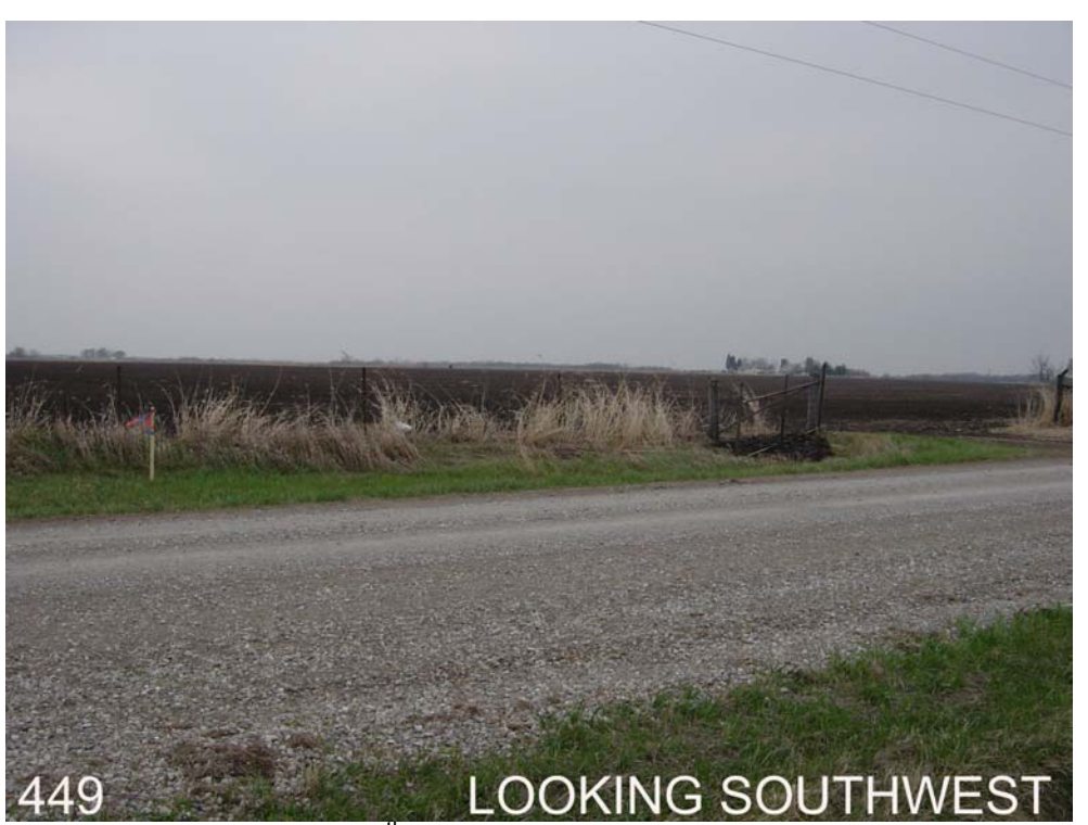
#449 is 25ft south of 160^{th} St, 60ft east of field ent to the south, \frac{1}{4} mi east of 280^{th} Ave.

Near the NW corner of Sec19, T77N, R10W.