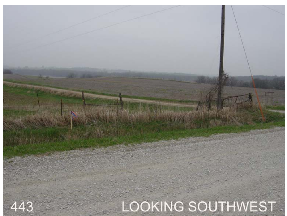
#443 is 5ft north of south ROW fence, 55ft east of farm lane to the south, 30ft south of 240<sup>th</sup> St, approx. 300ft east of 240<sup>th</sup> Ave(to the north). Near the NW cor of Sec 16, T75N, R11W.