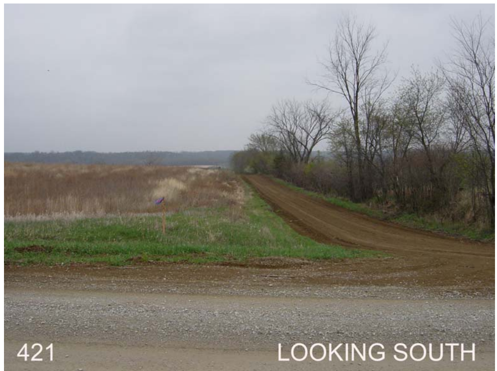
#421 is 25ft south of 280^{th} St, 25ft east of 162^{nd} Ave. In the NW \frac{1}{4} of Sec 6, T74N, R12W.