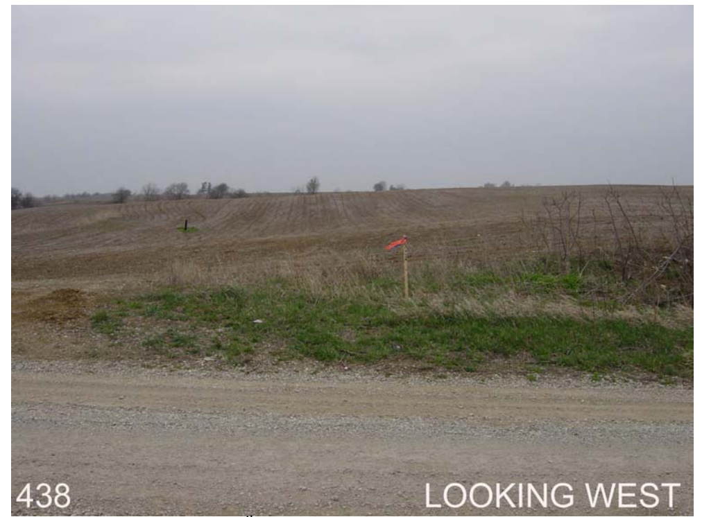
#438 is 20ft west of 247<sup>th</sup> Ave, 20ft north of field ent to west, 0.2mi south of county line.