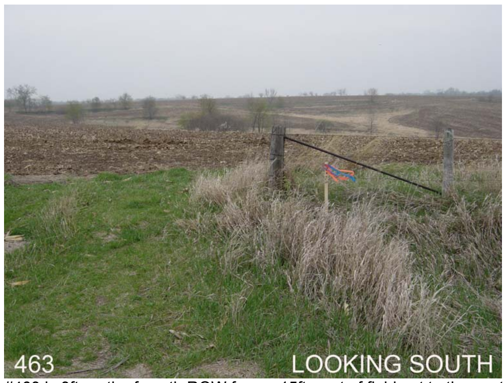
#463 is 3ft north of south ROW fence, 15ft west of field ent to the south, 30ft south of 290<sup>th</sup> St, 0.2mi east of 310<sup>th</sup> Ave. In the NW ¼ of Sec 10, T74N, R10W.