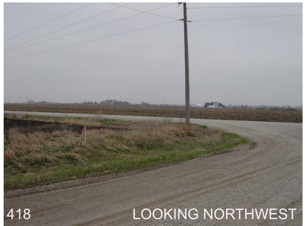
#418 is 30ft west of 163^{rd} Ave, 60ft south of 195^{th} St. In the SW \frac{1}{4} of Sec 19, T76N, R12W.