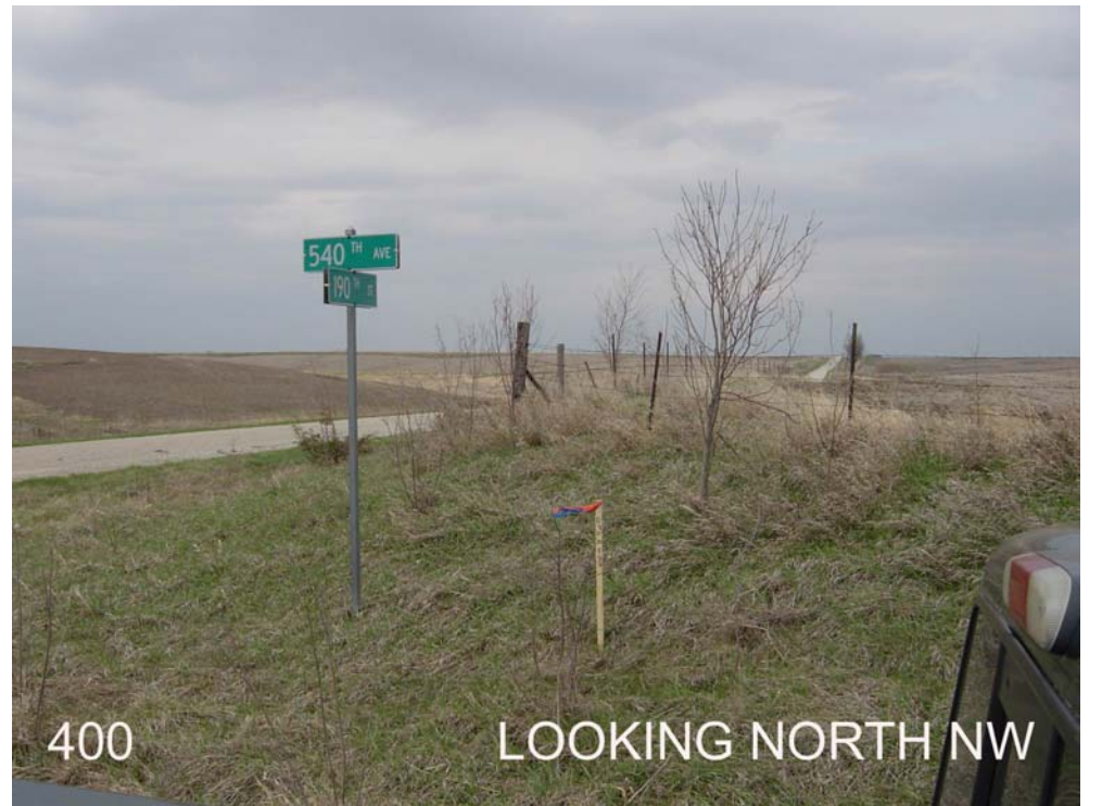
#400 is 30ft north of 540<sup>th</sup> Ave, 50ft east of 190<sup>th</sup> St(190<sup>th</sup> St to the north-Poweshiek Co) Near the NW corner of Sec 6 T77N, R13W.