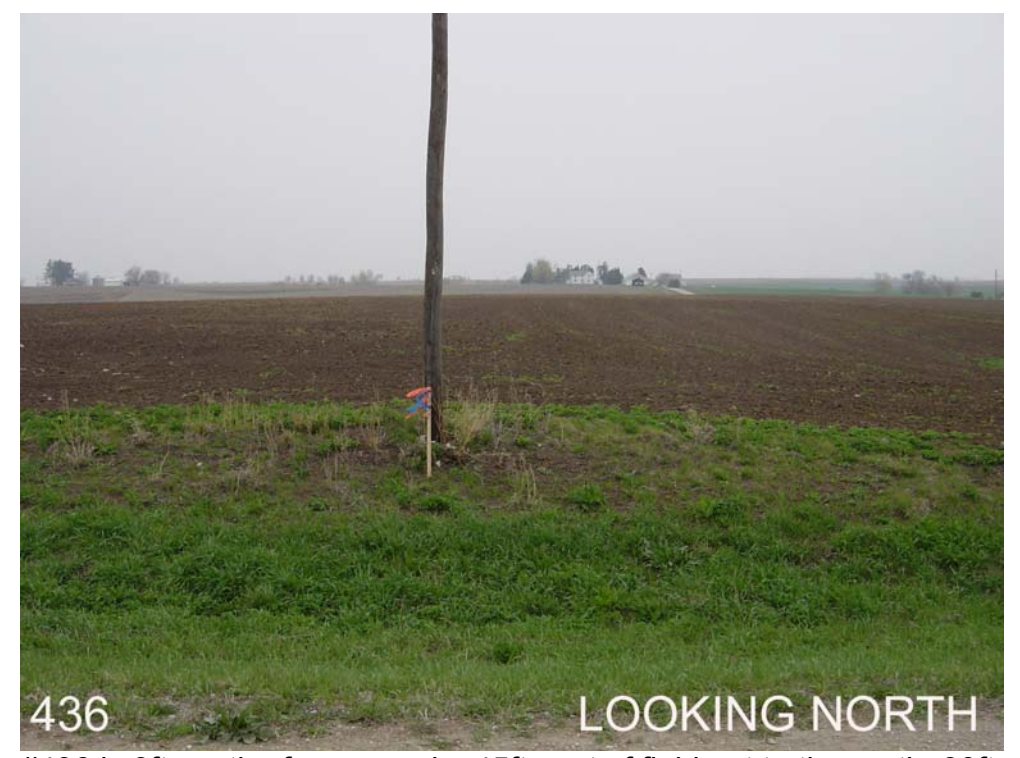
#436 is 3ft south of power pole, 45ft east of field ent to the north, 30ft north of 275^{th} St, 0.1mi west of 220^{th} Ave. In the NE \frac{1}{4} of Sec 36, T75N, R12W.