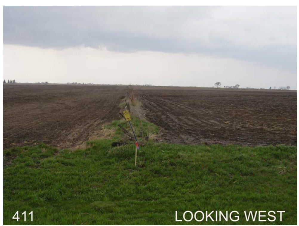
#411 is 45ft west of the west edge of Hwy 21, 1/4mi north of the SE corner of Sec 16.

1/4mi north of the SE corner of Sec 16, T76N, R13W.