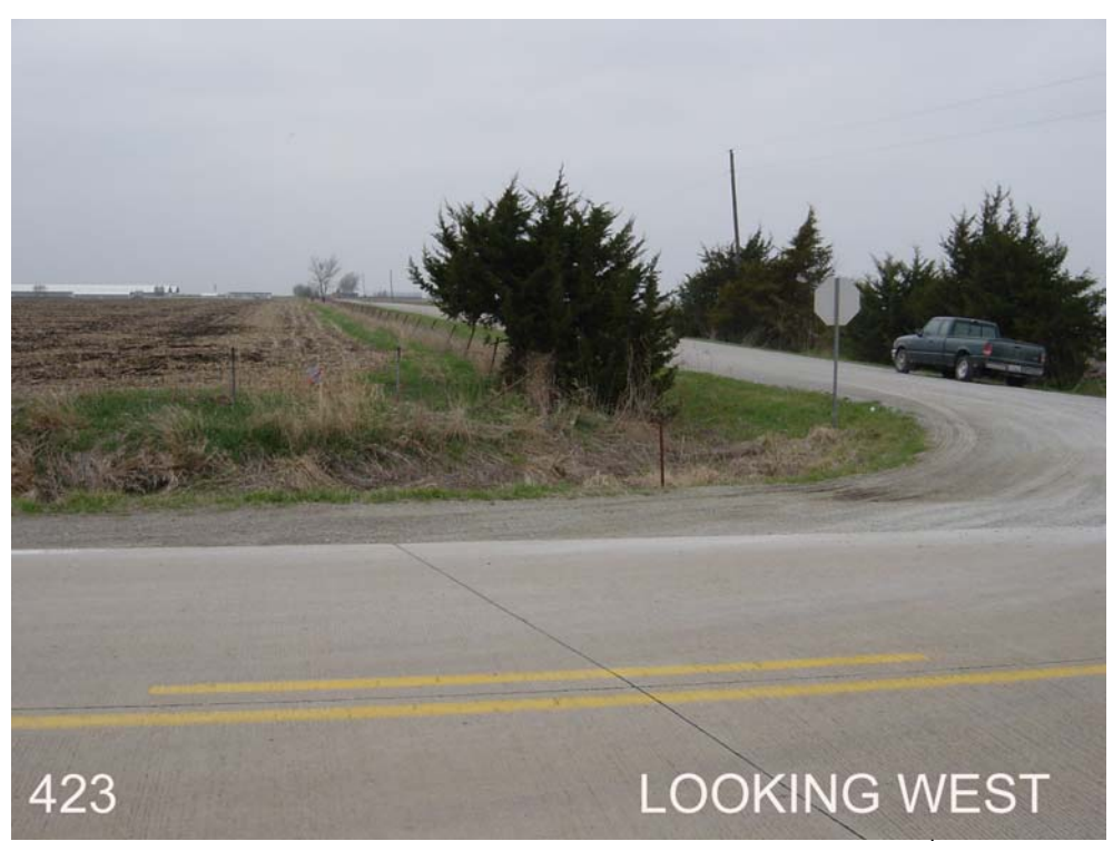
#423 is 3ft east of the west ROW fence, 50ft south of 103<sup>rd</sup> St, 50ft west of 190<sup>th</sup> St.