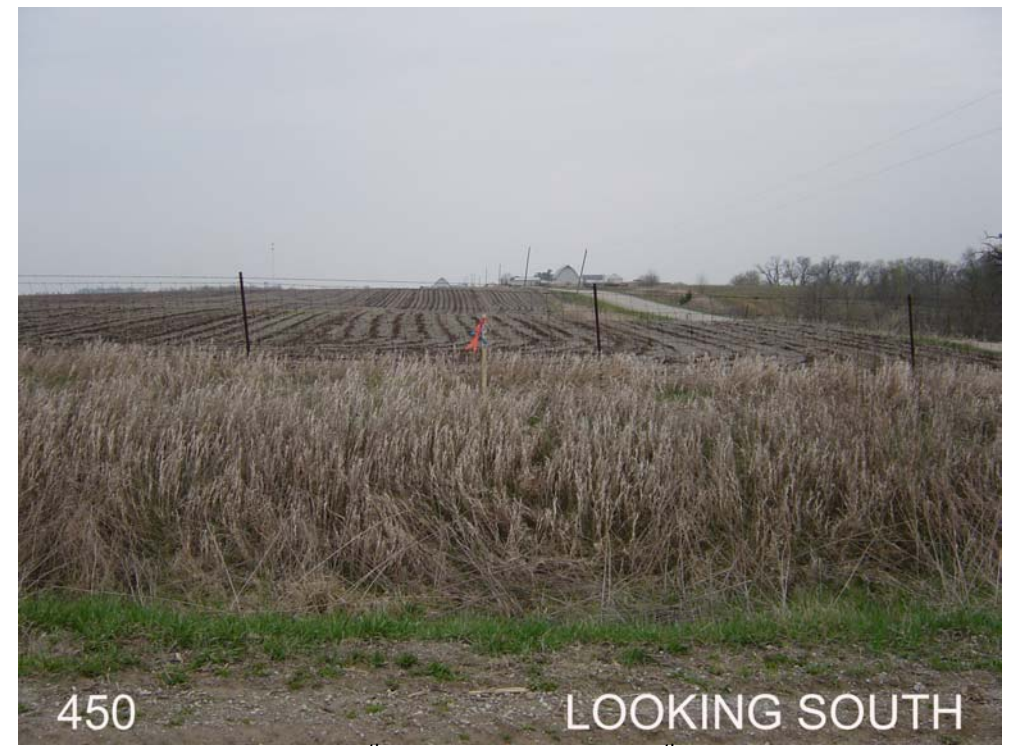
#450 is 30ft south of 190<sup>th</sup> St, 80ft east of 280<sup>th</sup> Ave. Near the NW corner of Sec 19, T76N, R10W.