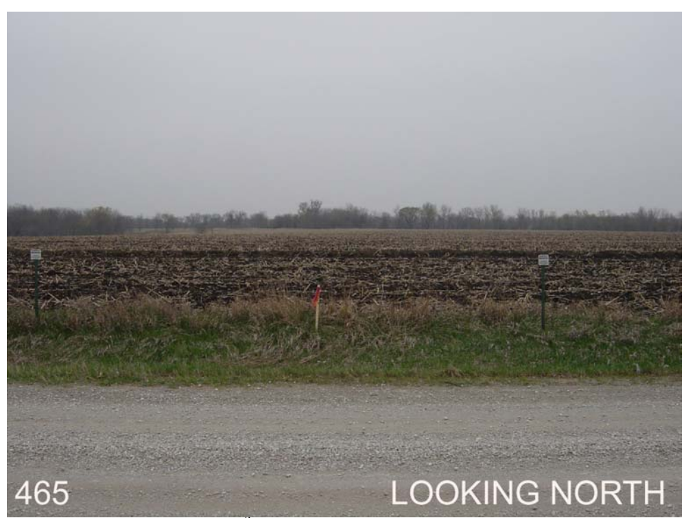
#465 is 30ft north of 335<sup>th</sup> St, near the E \frac{1}{4} cor of Sec 33. Near the E \frac{1}{4} corner of Sec 33, T74N, R10W.