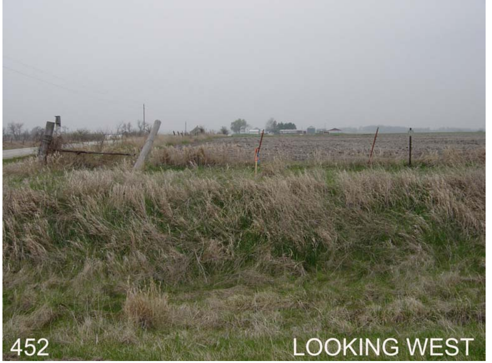
#452 is 5ft east of the west ROW fence, 50ft west of the east edge of V67, 60ft north of 250<sup>th</sup> St.

Near the SE corner of Sec 13, T75N, R11W.