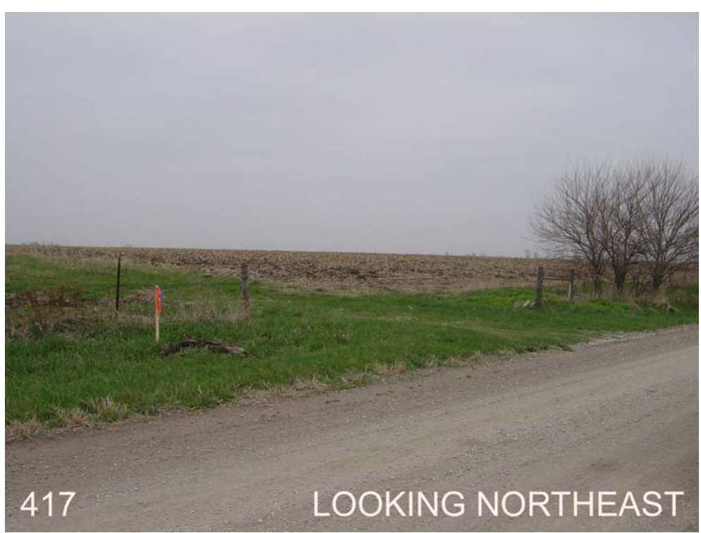
#417 is 3ft south of the north ROW fence, 25ft west of field ent to the north, 25ft N of 160<sup>th</sup> St, 170ft east of 160<sup>th</sup> Ave. Near the SW corner of Sec 31, T77N, R12W.