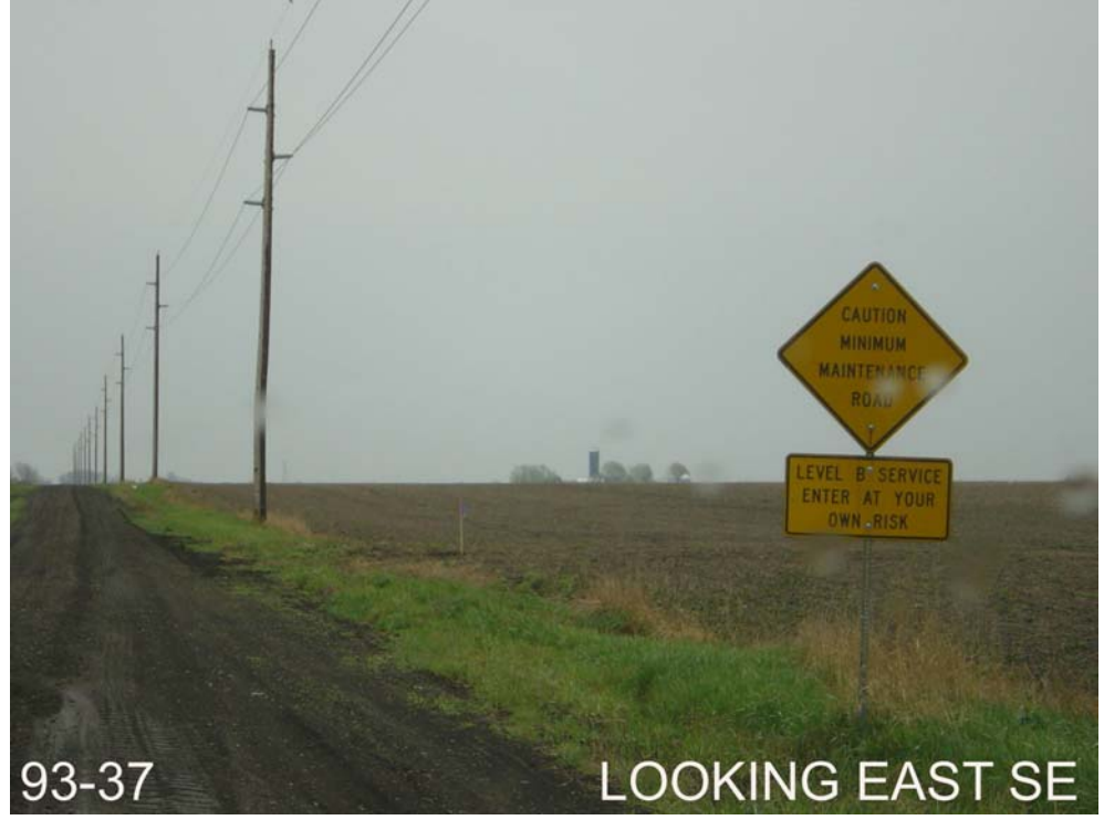
Found Wapello Co GPS point 93-37on 4-16-03