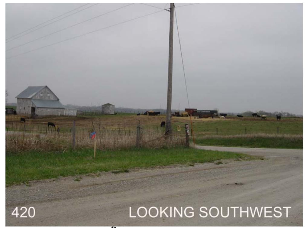
#420 is 25ft south of 245<sup>th</sup> St, 5ft north of south ROW fence, 60ft east of 163<sup>rd</sup> Ave.