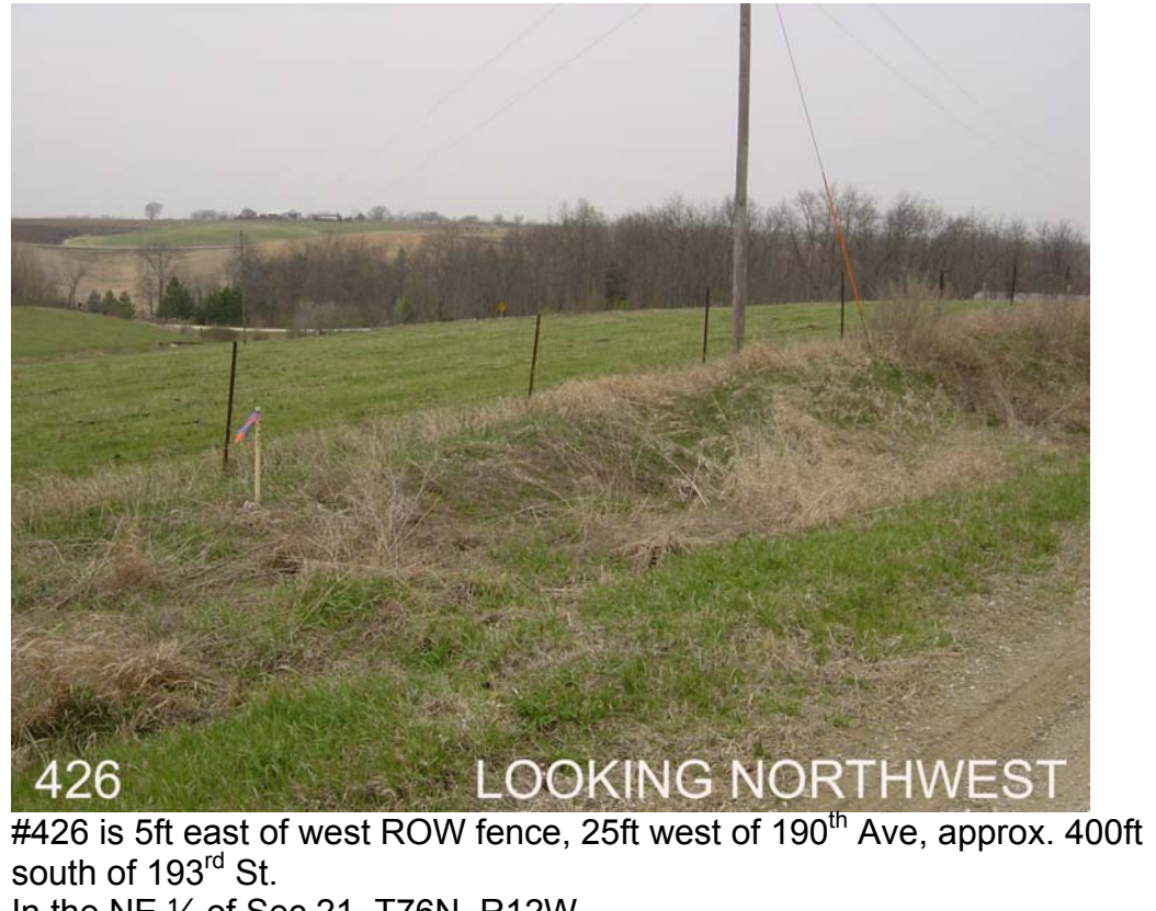
In the NE 1/4 of Sec 21, T76N, R12W.