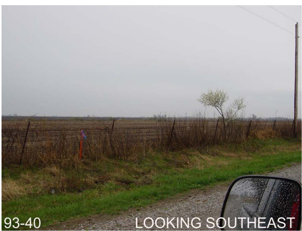
Found Wapello Co GPS point 93-40 on 4-16-03