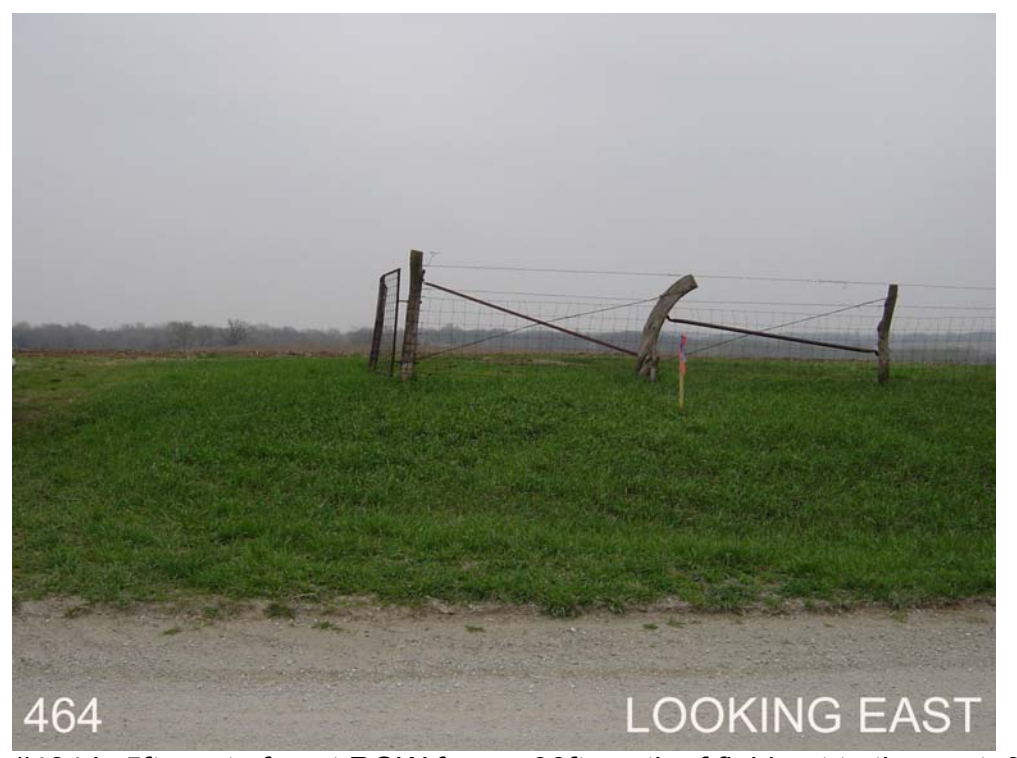
#464 is 5ft west of east ROW fence, 30ft south of field ent to the east, 30ft east of 310^{th} Ave, 150ft south of 310^{th} St. In the NW \frac{1}{4} of Sec 22, T74N, R10W.